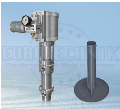
P2001-7.340 for floor mounting

The basic version consists of the pump P2001 ( floor mounting with stand or wall mounting with mounting bracket ), silencer and safety valve.