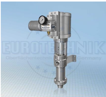
P2001-7.340 for wall mounting