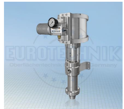
P2001-10.340 for wall mounting