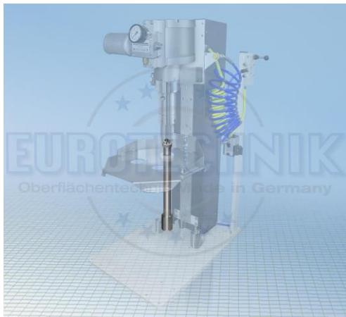
Suction pipes with check valve for M2001 on 30 liter Hobbock-lifter Part-No.: 15006 992583R