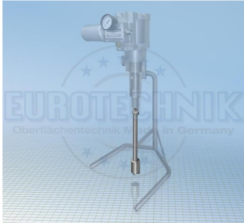
Suction pipe with check valve for M2001 on stand Part-No.: 15006 992425R

Application examples for Kopperschmidt devices