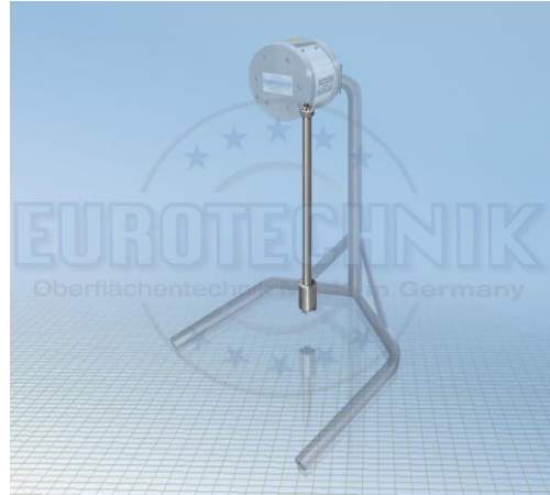
Suction pipe with check valve for KS20850 on stand Part-No.: 15006 992675R