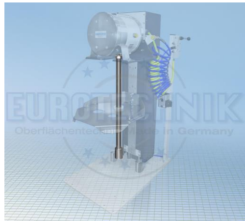
Suction pipes with check valve for KS20853 on 30 liter Hobbock-lifter Part-No.: 15006 992675R