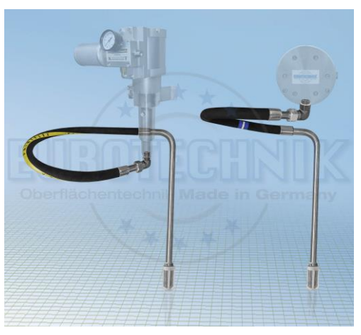
Suction system with chemical hose for Hobbock container

Suction system with Paintflex hose for 200 liter barrel