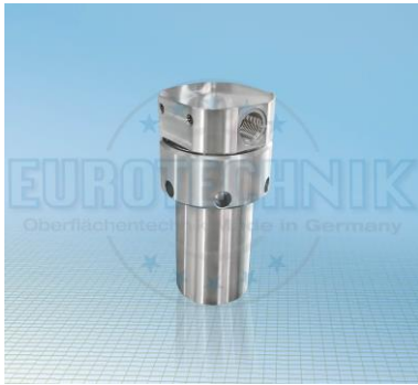
Filter PN 500 basic version without any fitting