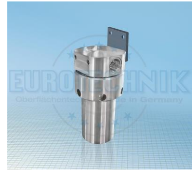
Filter PN 500 basic version for wall mounting