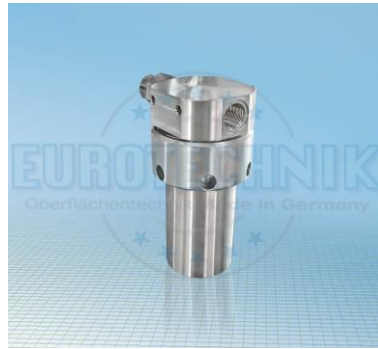
Filter PN 500 basic version for pump mounting