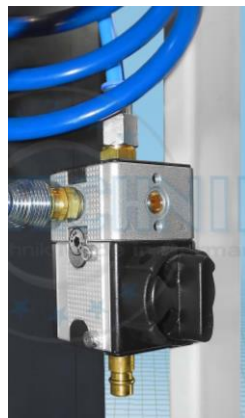
Lockable ball valve (S3)