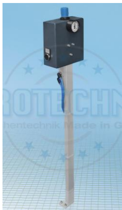
Version 2-hand operation (S1)

Support column powder-coated in RAL 7016 anthracite gray fine structure.