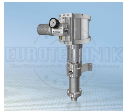
P2001-10.340 for wall mounting