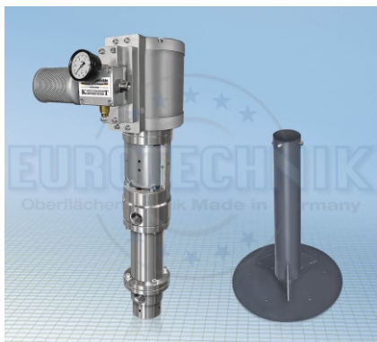
P2001-7.340 for floor mounting

The basic version consists of the pump P2001 ( floor mounting with stand or wall mounting with mounting bracket ), silencer and safety valve.