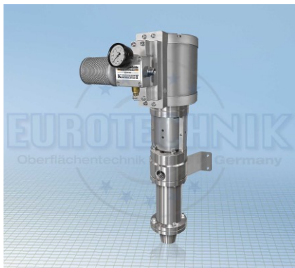
P2001-7.340 for wall mounting